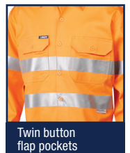
Twin button flap pockets