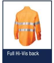
Full Hi-Vis back